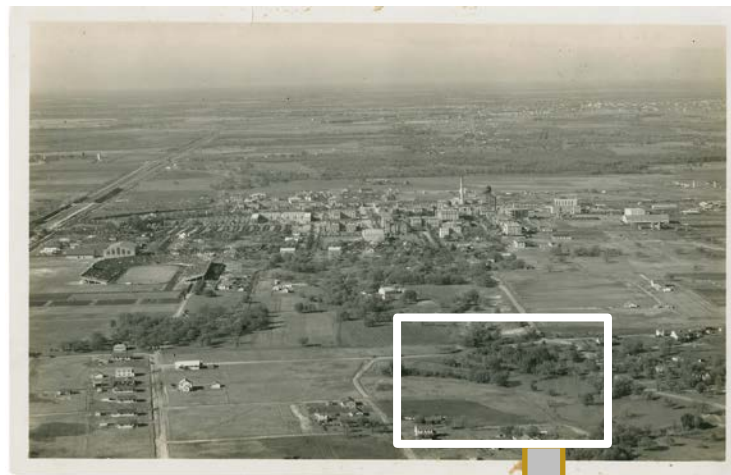
605 Guernsey home not seen (view from the south)