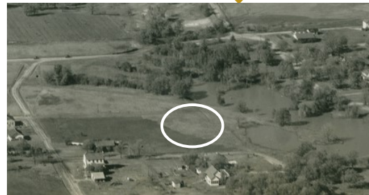
1929 Aerial View of A&M College and a portion of College Park in Southside