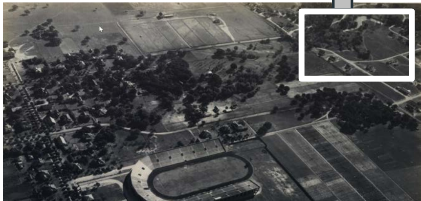
1932 Aerial view of A&M College and a portion of College Park in Southside