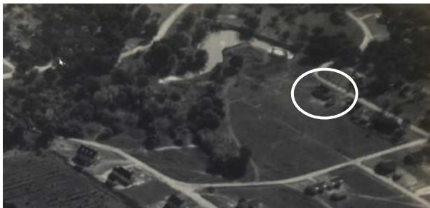
605 Guernsey home constructed between 1929 and 1932 (view from the north)