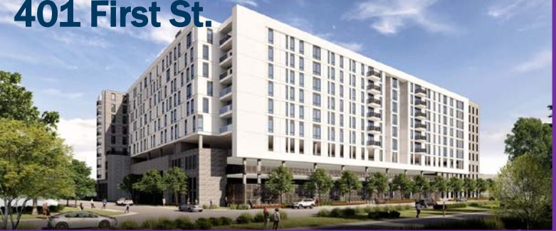
Otto 401 First St.